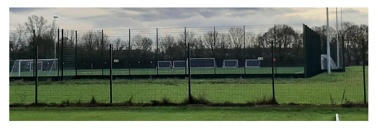
The new all-weather football pitch with floodlights

the Football Association, the British Cycling Union and Sports England and through the sale of some adjoining land for housing.