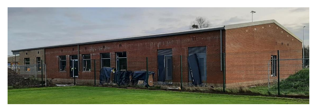
The new pavilion very close to our lawns

While all the construction work has been going on – hopefully it should be finished by the start of the 2024 season – this year has been extremely difficult. The car park next to the Club has been used as the site for matériel, heavy construction plant and suchlike. This has necessitated using the car park of the Garden Centre opposite which entails a 500m walk across a very busy industrial estate road and the field (the housing site), finally negotiating a track which is currently ankle-deep in mud from the construction. To add to this, we always have an eye on the clock as the Garden Centre closes its gates (especially early on Sundays) and no one wants to have their cars locked in for the night.