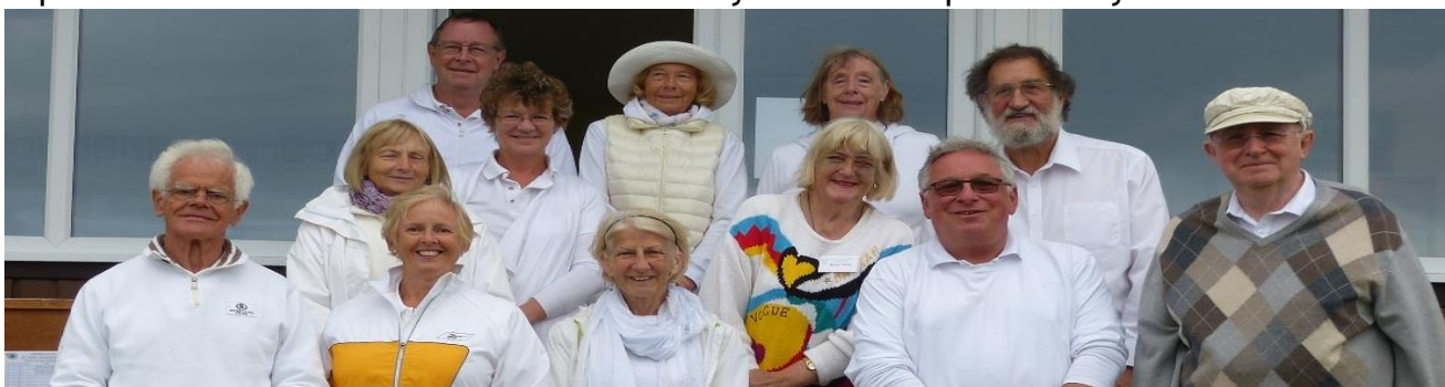
The GC contingent looking very happy - they must have eaten the buttered scones

The weather on the Thursday was kind to us, but the forecast for the Friday did not look good. However, the threat of rain never materialised, the atmosphere was friendly and relaxed, and the feed-back suggested that everybody enjoyed the tournament. A surprise treat of buttered scones on the GC day went down particularly well.