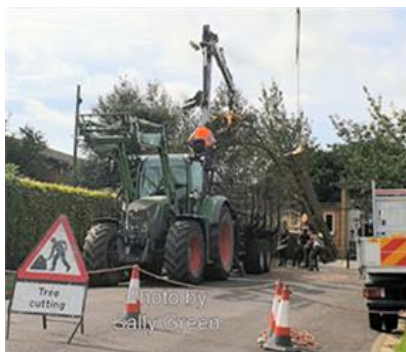
Road closed: equipment in place

One of the problems that we had was that our lease from the council meant that we had to pay all costs relating to the removal of the tree, which in the end cost us around £3000. Possibly clubs in a similar situation to Bristol should have a close look at their lease.