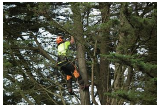
The first ascent