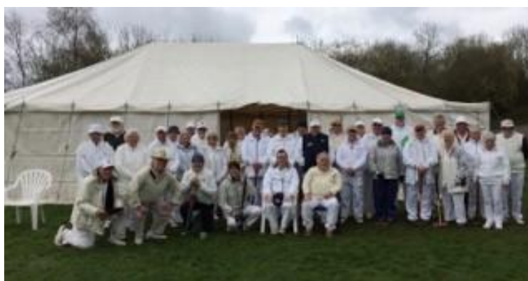
The Sunday Crowd at Camerton & Peasedown